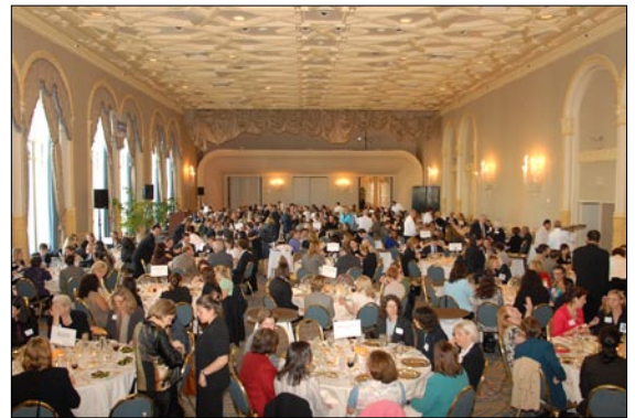
Annual Judges' Dinner at the InterContinental Mark Hopkins