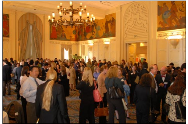
Pre-dinner reception at the InterContinental Mark Hopkins