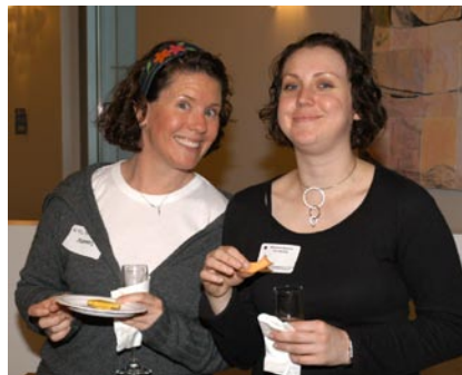
Two attendees at champagne reception