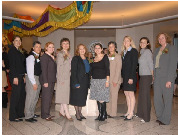
Newly sworn Queen’s Bench officers