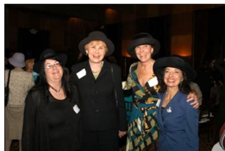
Past Presidents enjoy the party.