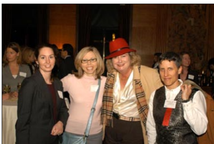
Attendees enjoy the reception.